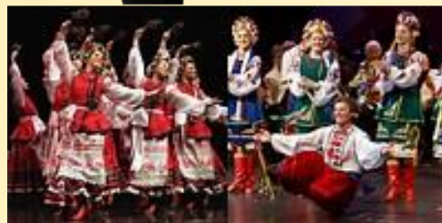
Dunai Ukrainian Dance Ensemble